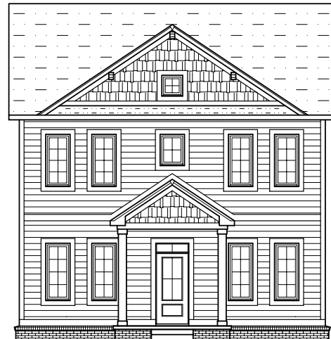
AMERICAN STANDARD 2