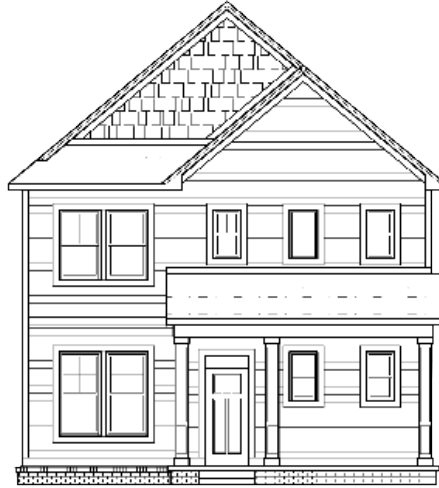
AMERICAN STANDARD 2